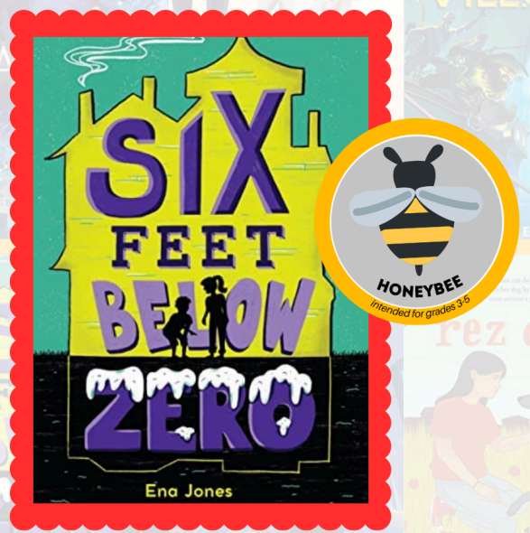
2023-24 Nebraska Golden Sower Award