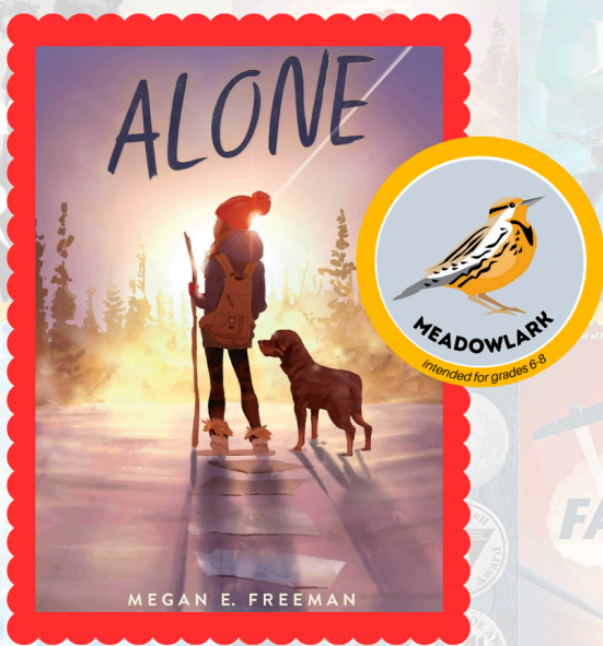
2023-24 Nebraska Golden Sower Award

The Nebraska Golden Sower Award exists to foster a lifelong enjoyment of reading for pleasure in Nebraska's youth. Since 1982, Nebraska Golden Sower Award has sought to sow seeds which stimulate children's thinking, introduce different types of literature, encourage independent reading, increase library skills, and foster an appreciation for excellence in writing and illustrating.